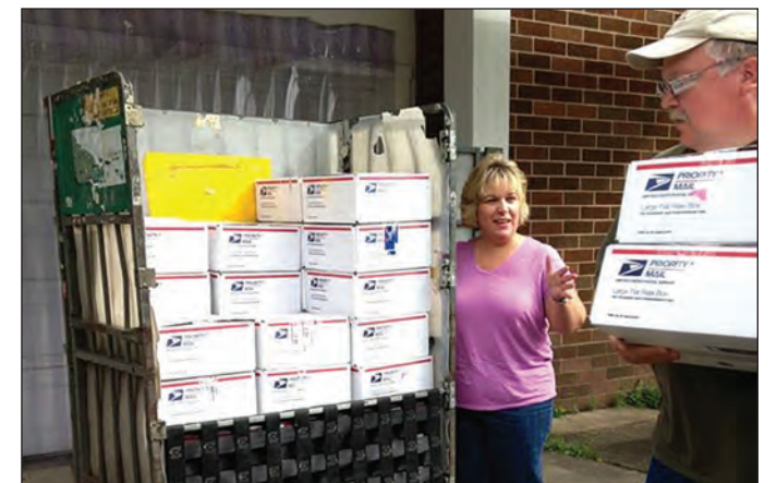
Eastman hosts care package drives to prepare and mail packages to deployed employees and their family members.